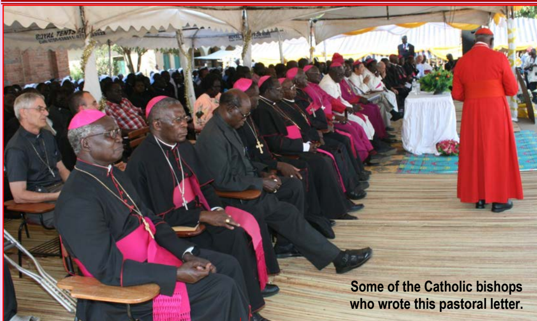
Some of the Catholic bishops who wrote this pastoral letter.